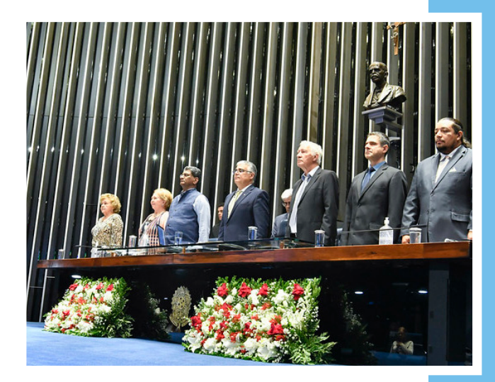
A SPECIAL TRIBUTE to the ISSE BRAZIL (Brazil, August 26, 2022)