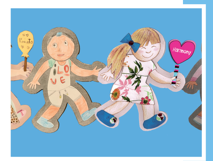
PEACE FRIENDS A PROJECT FOR EVERYONE

This unprecedented programme for public school teachers designed to uplift civic education with value focus , and approved by the Italian Ministry of Education, is ongoing. Its overall concept is linked to the area of education concerned with sustainable development and is being carried out by the Italian team of the Institute of Sathya Sai Education of South Europe (ISSE SE). The first module of the Training Programme "Education in Human Values - a Path for Life", highlighted by the acrostic "P.A.C.E.: Pensieri in Armonia, Comportamento in Equilibrio" (PEACE: Thoughts in Harmony, Behaviour in Balance), was held online from October 2021 to June 2022. The programme will continue throughout 2023 with modules 2 and 3.