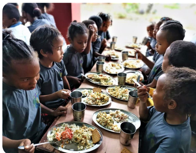
Lunch time at the Sathya Sai School of Antananarivo

Go-green initiatives are also encouraged in the backyard of the Sathya Sai Primary School where children and school staff are delighted to care for a garden of flowers, fruits and vegetables for the needs of the school and also to share with the neighbouring people in need. Every year a tree planting program is organized, and from 2023-2024 1700 trees have been planted. In June