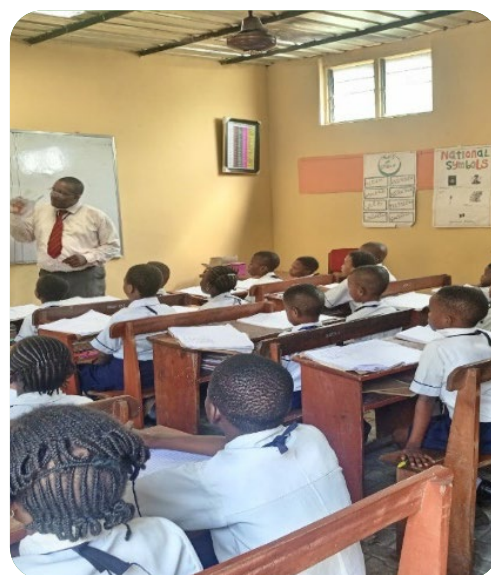
An inspiring lesson at the Sathya Sai School of Uthuru, Kenya

The Sathya Sai Education in Human Values programme (SSEHV) upholds all-round education, emphasizing both character development and academic excellence. It does so by promoting harmony in thought, word and deed, and by encouraging students to discern and to be kind and compassionate, as they tune into the unifying potential of Human Values. Sathya Sai Schools, Institutes, curricular, co-curricular and community SSEHV programmes provide an ideal ground for nurturing and spreading these values, which include respect, kindness, trust, tolerance, honesty, understanding, among many more. The programmes aim at making students into exemplary citizens and professionals, conscious of the need to embed values in their day-to-day lives, and radiate peace at the individual, community, national, and global levels.