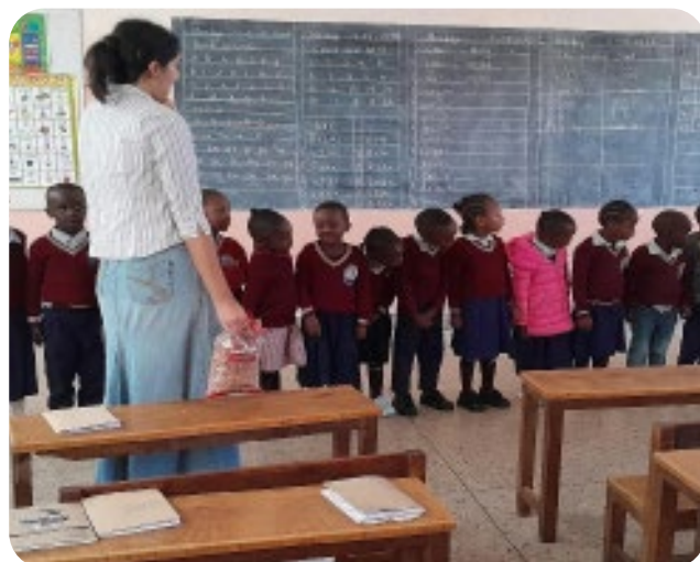
Sathya Sai School of Uthiru, Kenya