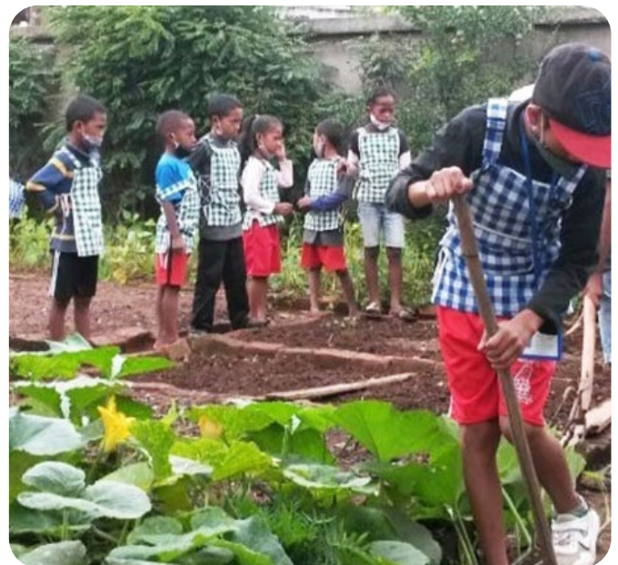
Gardening lessons at the Sathya Sai School of Antananarivo, Madagascar