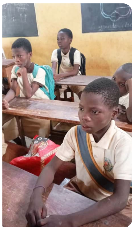
Students absorbed in lessons at the Sathya Sai School of Abomey, Benin

The number of students is growing, from the class of beginners to the third level, called CE2 in Benin. The local population is eager to enroll their children in the school, because of its reputation for providing quality education. Since 2021 there have been many challenges, but with the generous support of the SSSIO World Foundation another place was acquired to carry out the reconstruction of a new school which will open at the end of September 2025.