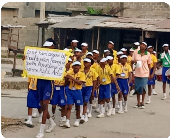
Students from the Sathya Sai School of Lagos, Nigeria participating in the annual Peace Walk

Village, Ajah. Basic infrastructures such as classrooms, drinking water and washrooms were constructed. Today the Sathya Sai School of Lagos is a registered school, approved by the Lagos State Government. It has 166 pupils with 12 full-time qualified teachers, five part-time teachers and seven support staff. A variety of subjects recommended by the Lagos State government including French, music, computer education, sports are being formally taught as part of the curriculum subjects. The school has all basic amenities including good internet, a power back-up generator, and laptops for teachers and students. The curriculum is compliant with the Lagos State government approved syllabus.