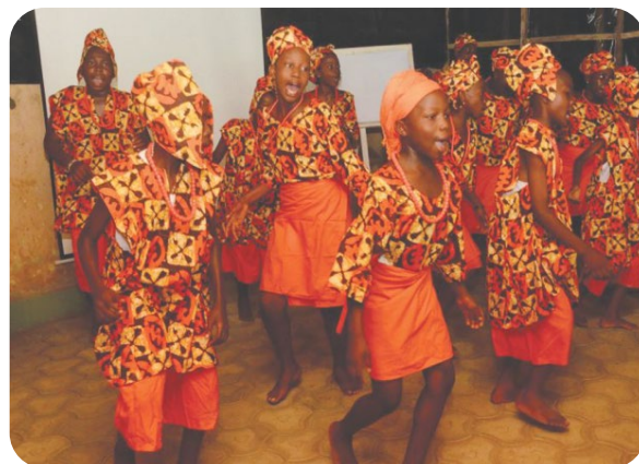
Lji-Ibile, Yoruba Dance by the pupils at the Sathya Sai School of Lagos, Nigeria