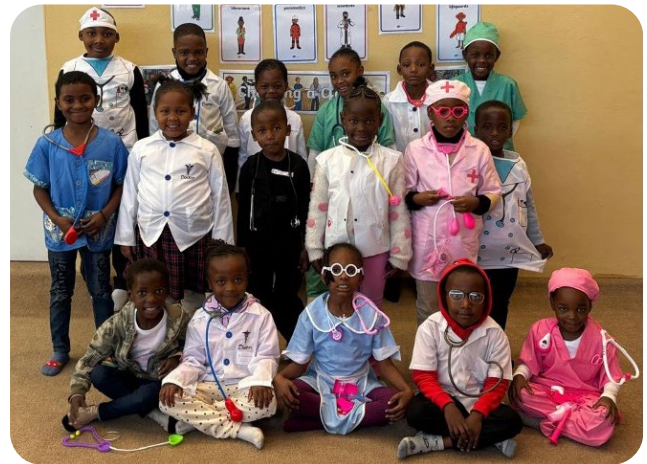
Career day at the Sathya Sai School of Newcastle, South Africa

all religions and cultures. Its activities reflect the cross-cultural and multi-religious diversity of South Africa. Irrespective of many challenges encountered through lack of resources, lack of parental support and language barriers, the educators are very positive, and all are dedicated to the Education in Human Values programme. The children receive lunches every day through a donor. The school fraternity trusts its guiding principles that are the cornerstone on which daily tasks and lessons are based. In June 2025 the Sathya Sai School of Newcastle held its career day. The learners dressed in various professions. This was followed by a vibrant career-themed parade, in which all learners participated, proudly displaying their chosen career outfits.