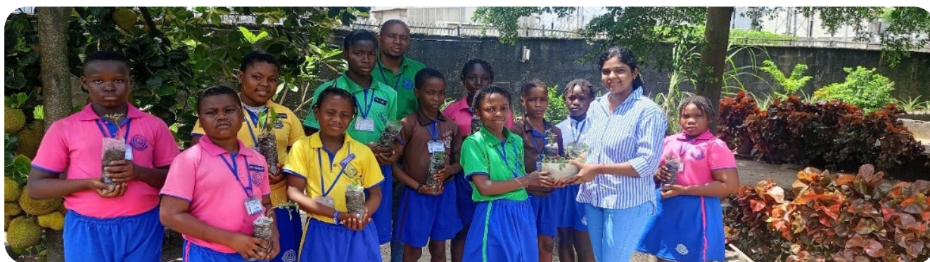
Seeds of Love Programme - Sathya Sai School of Uganda

and attire of the past. The day ends by honouring the elderly for their valuable insights and contribution to the community. Parent-Teacher dialogue sessions are held every third Friday of the month. This is a cherished event for the parents and guardians to enjoy their children's performance and participation in class activities shared in the classroom environment. This sharing session is aimed at providing help and supporting the children's needs both at home and at school. The school also organizes a "Walk for Values" and voluntary service to the community programmes, while tree planting is also major activity of the school. A five-year development plan emphasizes infrastructural development which started in the year 2021. The Sathya Sai School of Uganda has maximized the use of the land and started a farming project. All vegetables have been used to make nutritional meals for the students.