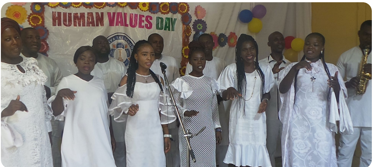
Teachers Chorus delights students and their families during Human Values Day at the Sathya School of Lagos, Nigeria.