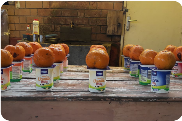
Meals and healthy snacks are provided in all Schools

Parents and teachers agree that the Sathya Sai Schools in their countries have brought abundant opportunities and benefits to the Community. If on one hand the schools offer academic excellence, on the other they are places where the values of Truth, Right Conduct, Peace, Love and Nonviolence are experienced and practiced by learning to "Love all - Serve all". The SSEHV programme fosters peace and comfort at home, and the schools are a helping hand to the less fortunate in society – orphans, single parents or families with low incomes – thus enabling them to get free education as well as full help with their needs, including meals. Sathya Sai Education in Human Values is a journey of Self-transformation worth living!