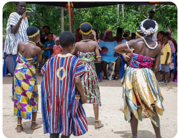
Traditions and Culture day at the Sathya Sai School of Ghana

The school has developed over the years through the assistance of the African Institute of Sathya Sai Education, which has delivered teacher training programmes. It has a strong and vibrant Parent Teacher Association (PTA), which has contributed to improving the moral standard of students to a high pedestal. The academic standard of the Sathya Sai School of Ghana is very high. A five-year development plan began in 2021, focusing on infrastructural development since the school presently has no classrooms for the Junior High School department.