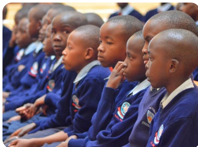
Students of the Sathya Sai School of Kisaju, Kenya

rooms, and a multipurpose hall to name but a few. It is equipped with 16 classrooms, modern Chemistry, Biology, Physics and Computer laboratories and two libraries, Administration offices, dormitories, spacious dining halls, and kitchens. The school is proud to announce that it currently has 284 students.