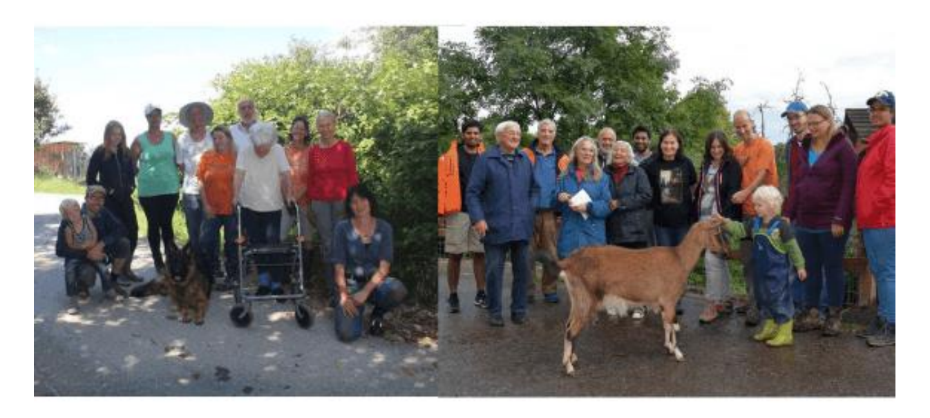
The Sai Animal welfare Team supporting Animal Spirit, Austria