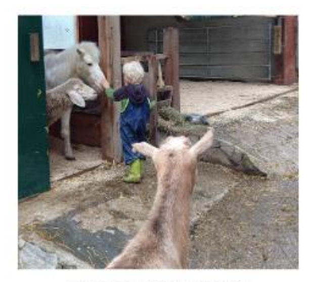
Alba (Pony), Sunshine (Sheep)

Children recognise the intrinsic value of animals; they know they are so important simply because they are living creatures. They ignite in the children a lifelong love of animals, and encounters with wild animals can be extra-special. Children learn about their differences and similarities and their needs (such as for food, shelter, space) and in this way their compassion and empathy for the animals grow.