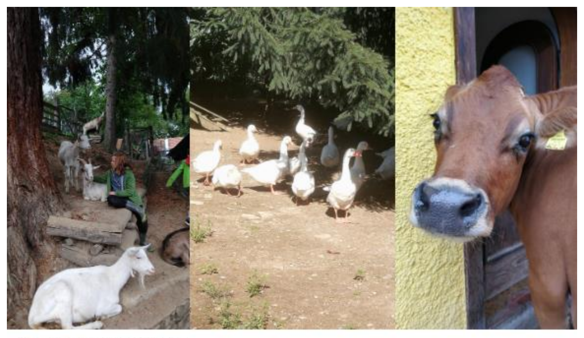
Tic, Tac, Toe & Rainbow (In Front) (Goats)